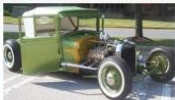
Karl's 28 Sport Coupe