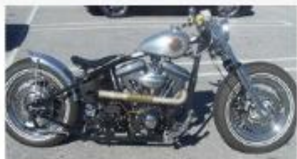
Zack's Acme Choppers Alumi-Bobber