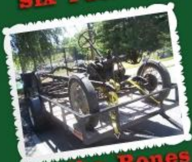
To the Bones